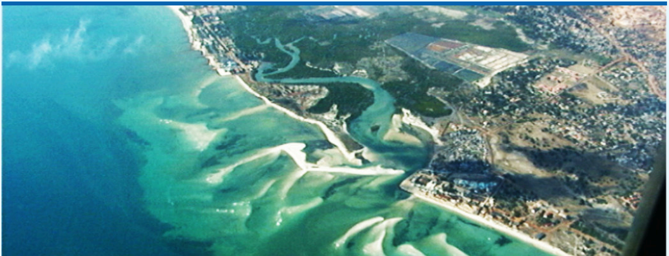
Aerial photograph of Kunduchi.

technologies, and fisherfolks' livelihoods, but the Principal and Canadian and Dutch 'experts' considered my suggestions to be irrelevant, and my wish to invite knowledgeable fishers to give lectures about small-scale fisheries to be contravening civil service regulations. I therefore chose to seek employment at the University of Dar es Salaam, and was fortunate to start work as a Tutorial Assistant from January 1973, with access to the wonderful facilities of the Kunduchi Marine Biology Station in its ideal setting for marine research and field visits for university students.