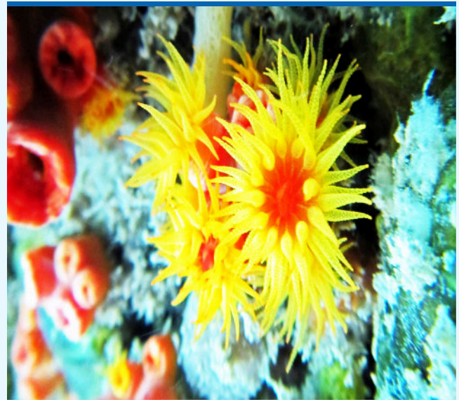
Tubastrea aurea at Mbudya island.

While studying phytoplankton from a base at Kunduchi Marine Biology Station, I also observed other marine ecosystem processes, and was able to bring University of Dar es Salaam students to Kunduchi to experience beaches, seagrasses, mangroves and coral reefs. Students cannot comprehend marine science without spending considerable time in these ecosystems, and they cannot appreciate the myriad of underwater life with incredible biodiversity without swimming and