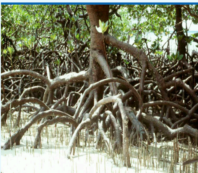
Rhizophora mucronata prop-roots, Kunduchi mangroves.